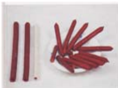
着色类肠衣 Dyeing Casing