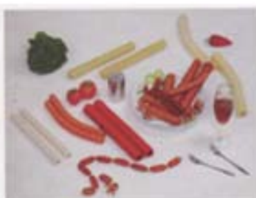
烟熏类肠衣 Smoked Casing