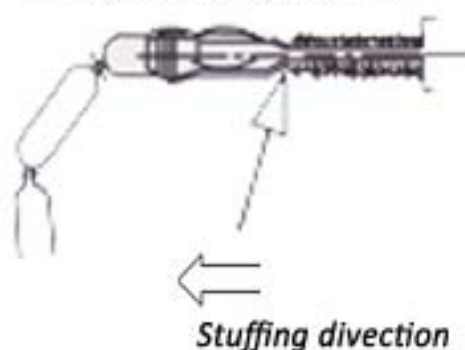
Spring-Kieking's fyle device