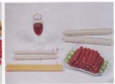
鲜肠类肠衣 Fresh Sausage Casing