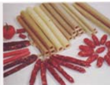
风干类肠衣 Drying Casing